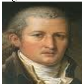
Dr. Edward Jenner

In England - the Grand Master is usually a member of the Royal Family. Currently it's Prince Edward, Duke of Kent. His Majesty King Carl Gustaf of Sweden is the High Protector of the Swedish Order of Freemasons. In the USA, many of our founding fathers as well as 14 presidents were Master Masons, along with one who was an Entered Apprentice, but never took further degrees.