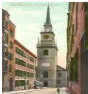
Old North Church, Boston

In Launceston, Tasmania in 1844, St John's Lodge took part in the ceremony of the laying of a foundation stone of a local Jewish Synagogue. The 96 th Regimental band attended with the permission of the colonel and played "Masonic Airs". The return was made to the lodge room with the band playing "Berne's Farewell" and the "Entered Apprentice".