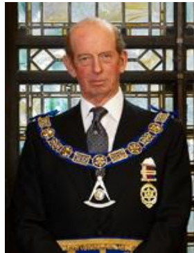
Prince Edward, Grand Master, UGLE

Many world leaders, politicians, presidents and members of royal families have claimed ties to the Craft. For example...In Africa - King Hassan II of Morocco was one, today president Idris Deby of Chad, Denis Sassou of the Congo, Mamadou Tanja of Niger, Paul Biya of Cameroon, Blaise Compaoré of Burkina Faso, and Omar Bongo of Gabon are all Freemasons.