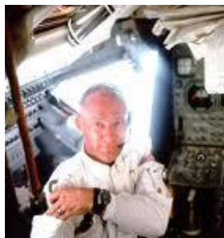
Brother Edwin 'Buzz' Aldrin

Dr. Edward Jenner discovered the vaccination process against smallpox in 1789. He was Worshipful Master of Faith and Friendship Lodge #270 in Berkeley, England at the time.